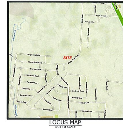
LOCUS MAP NOT TO SCALE