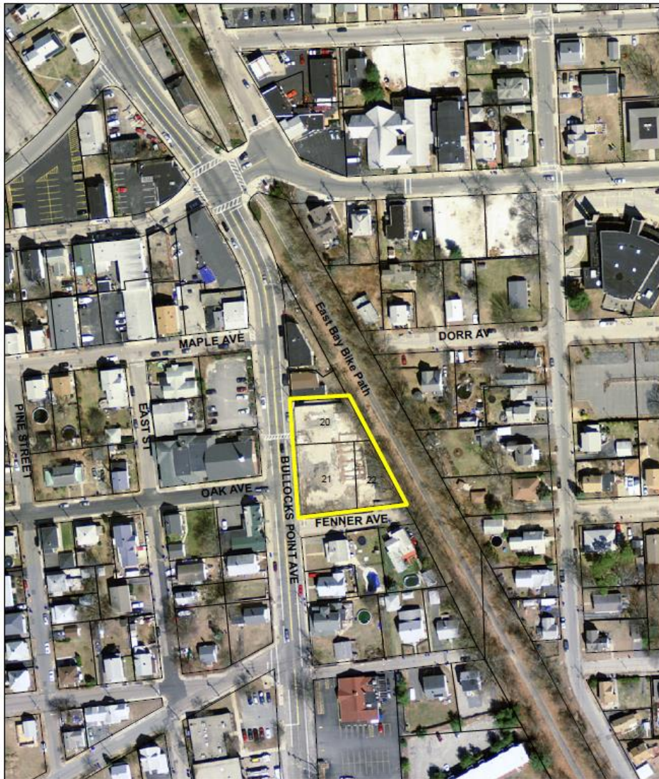
Redevelopment of the Riverside Square Site Map 312, Block 12, Parcels 20, 21, & 22