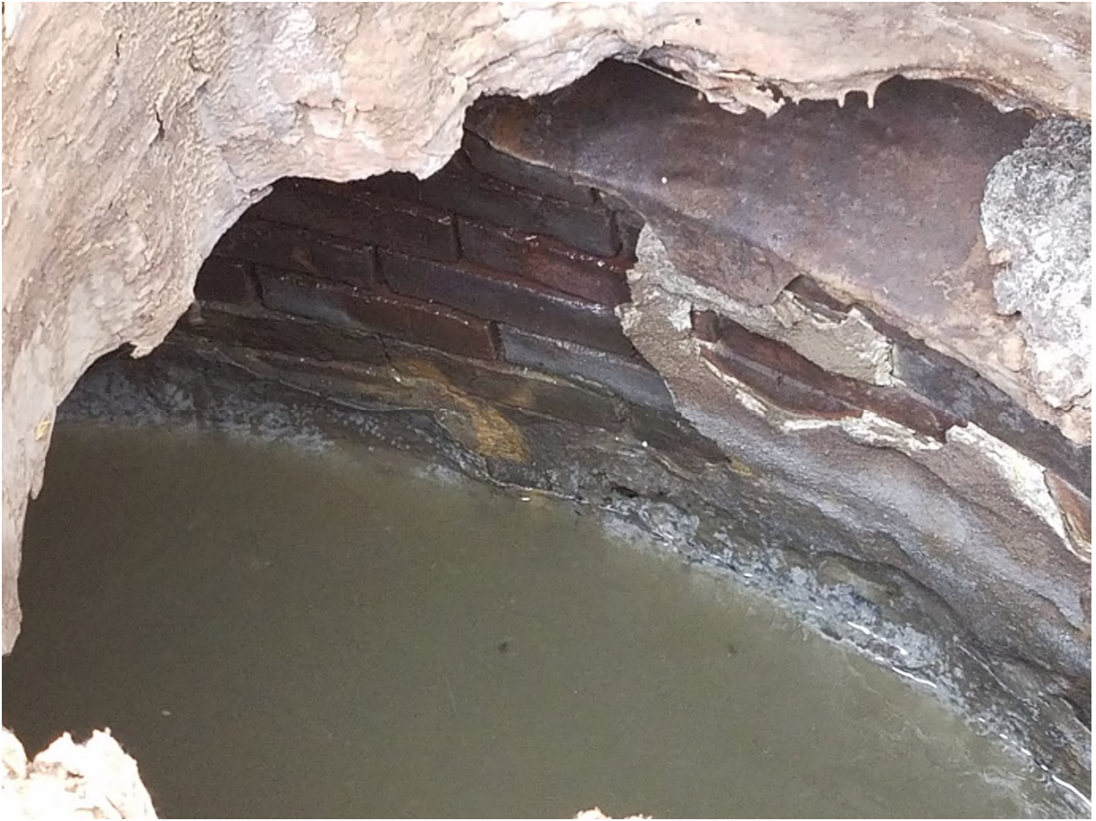
Out side turn of line