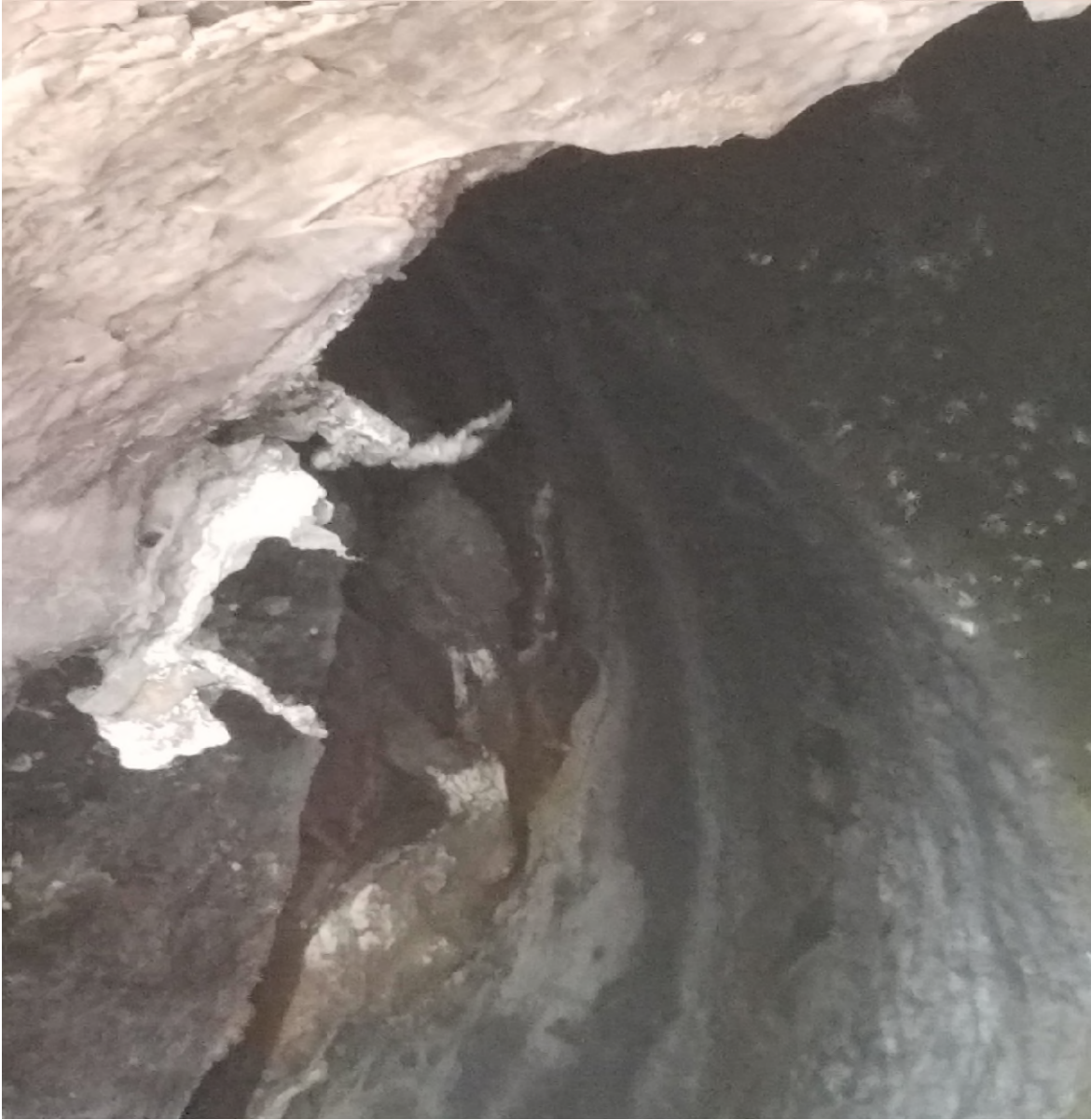
Looking down stream west side of MH