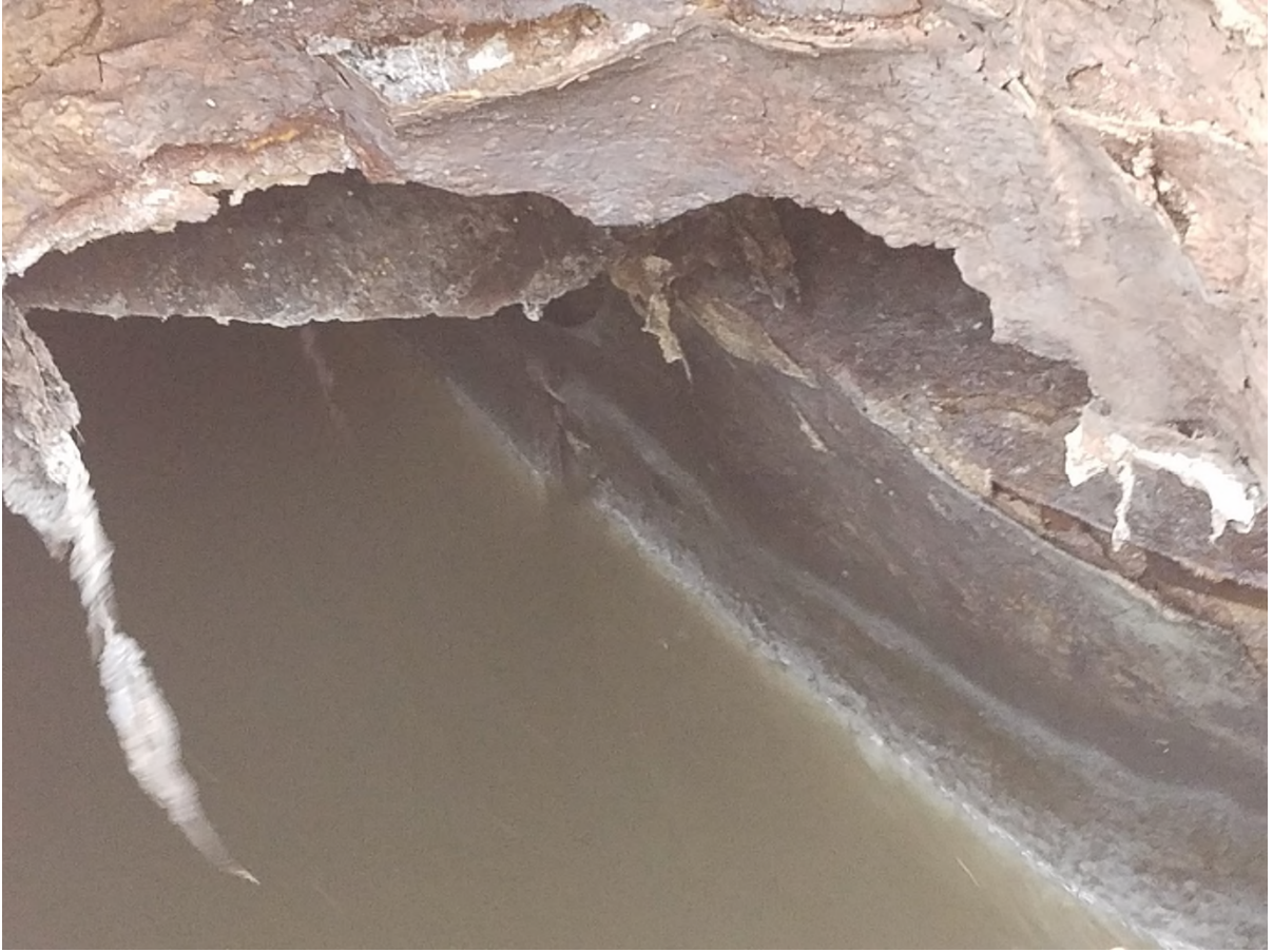
Looking down stream east side of MH