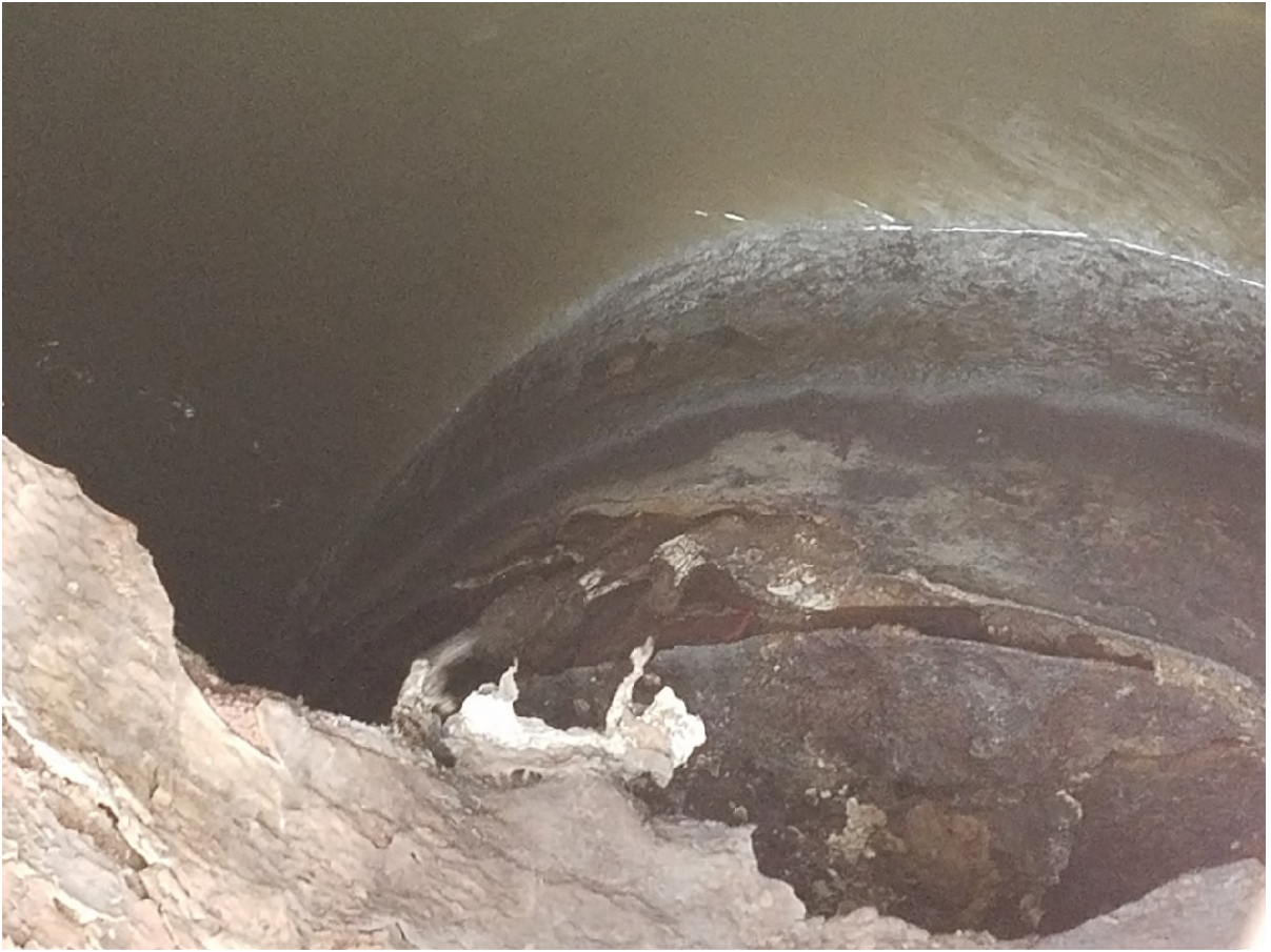
Inside turn of line