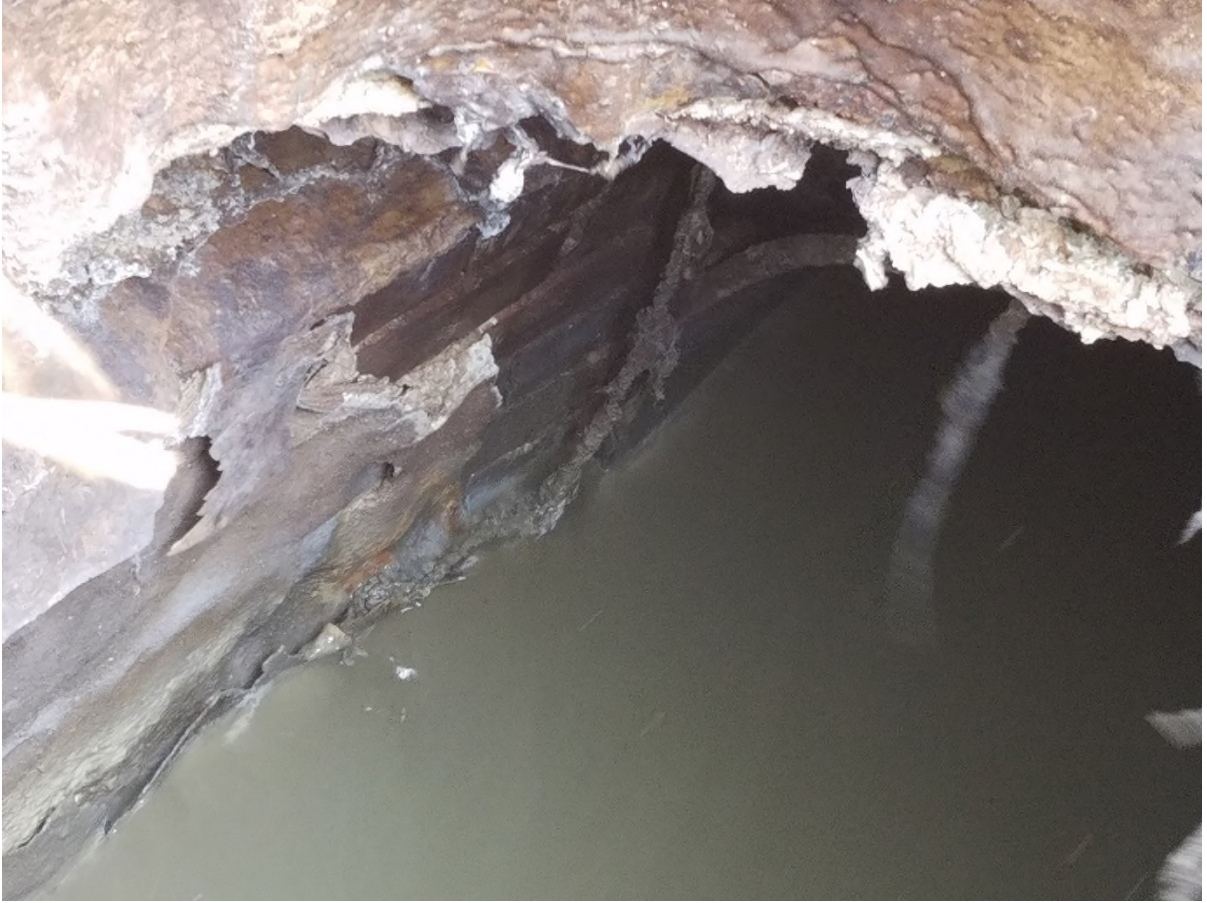
Looking up stream east side of MH