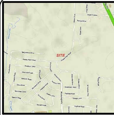
LOCUS MAP NOT TO SCALE