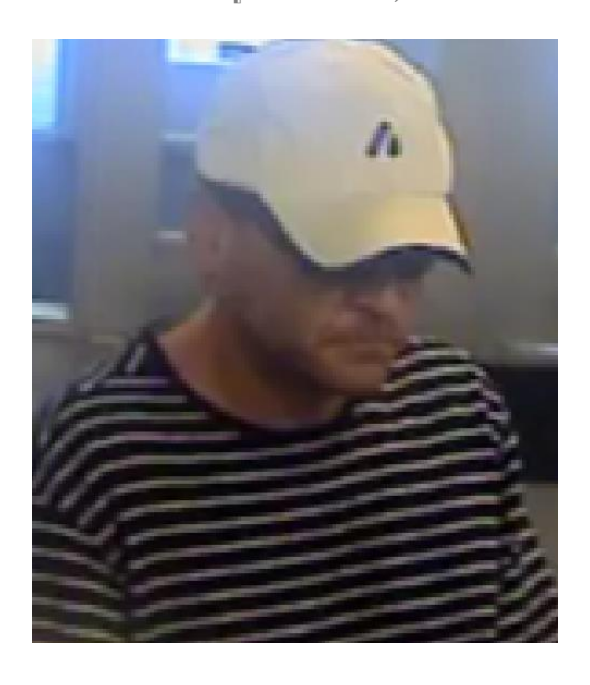
City of East Providence Department of Police 750 Waterman Ave. East Providence, R.I. 02914