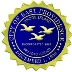
Roberto L. DaSilva Mayor

City of East Providence Department of Police 750 Waterman Ave. East Providence, RI 02914