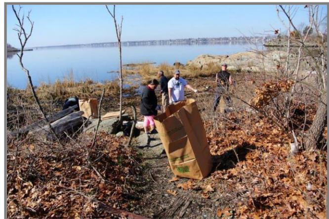
Conservation Commission, Ten Mile River Watershed Council and Prov. County Hiking Club Earth Day clean-up at Boyden Heights, April 18, 2015.

The Commission once again participated in the annual statewide Earth Day clean-up on April 18, coordinated locally by East Providence Department of Public Works Recycling Division. Members of the Ten Mile River Watershed Council, the Providence County Hiking Club, and students from East Providence High School joined us for a clean-up at the Boyden Heights Conservation Area including the beach, loop trail and boardwalk areas. Fourteen large bags of trash and several tires were collected and removed.